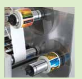
Rewinding to finished rolls