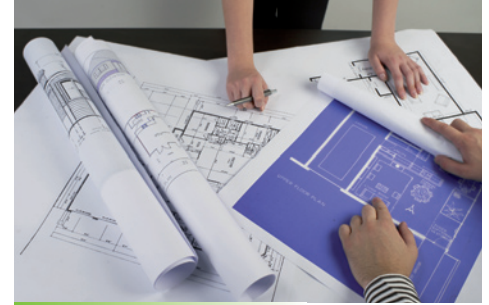
Technical Documents - Infrastructure