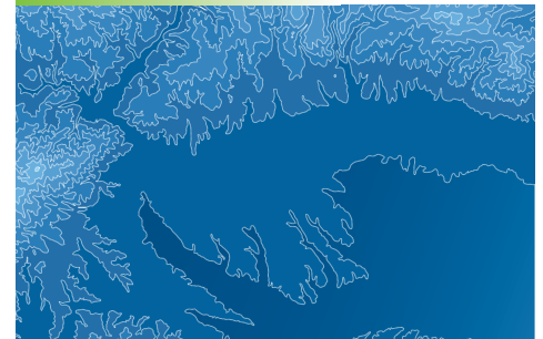
Geographic Information Systems