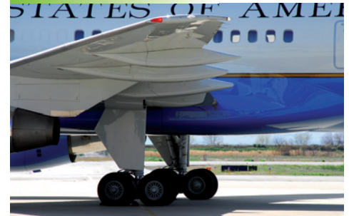
Government - Municipalities