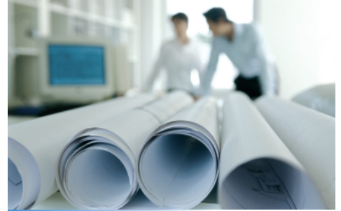
Architects - Engineers - Contractors