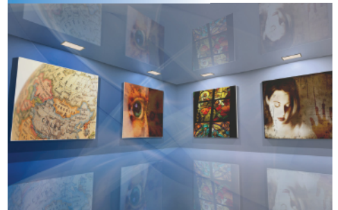
Copyshops - Reprographics