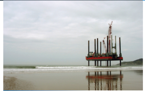
Oil & Mining Industries - Government Agencies