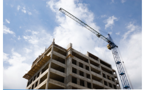
Architects - Engineers - Contractors