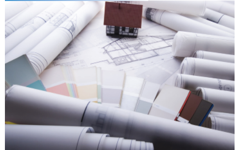
Copyshops - Reprographics