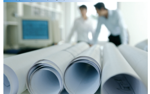
Geographic Information Systems