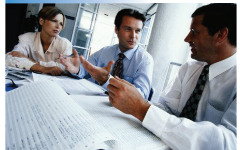
Government - Municipalities