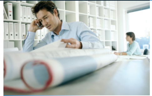
Architects - Engineers - Contractors