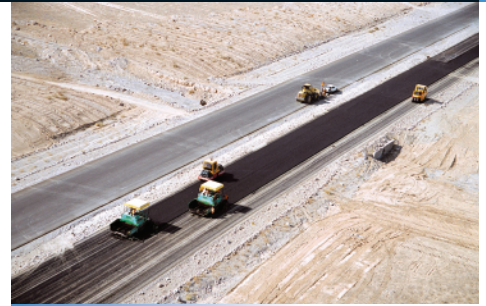
Architects - Engineers - Contractors