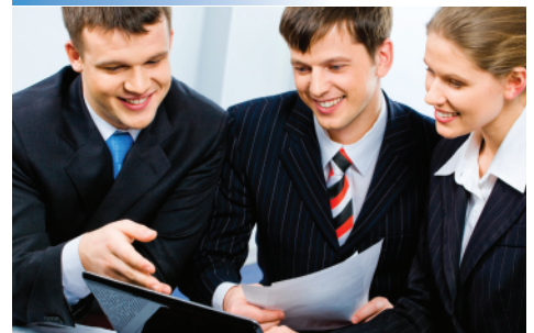
Government - Municipalities