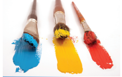
Copyshops - Reprographics